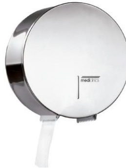
PR0789C bright finish