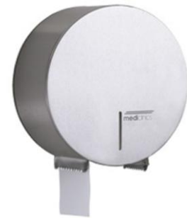
PR0789CS satin finish