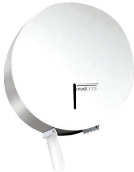
PR0789 White epoxy finish